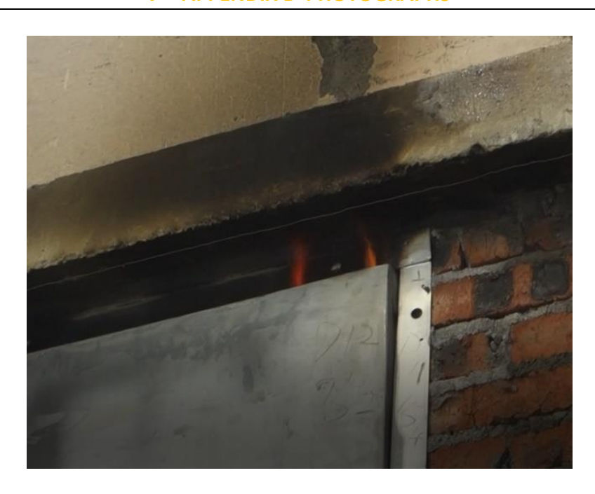
\label{eq:Photo 1.} Sustained flame on top right corner of the out-swing door on 22 minutes