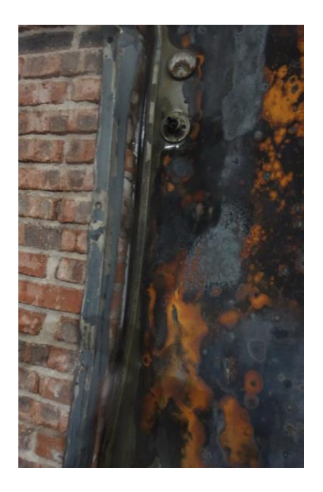
Photo 3. The strike jamb adjacent to the door latch edge of out-swing door after the hose stream test